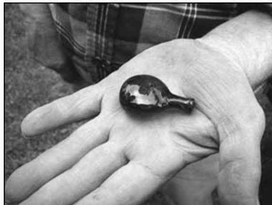
Small chestnut-type bottle found at the Pitkin Glass Works.

The most significant artifact found in a recent dig is a small Pitkin chestnut bottle only 1.85 inches high.