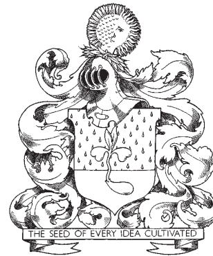
Manchester Garden Club Manchester Connecticut est. 1926