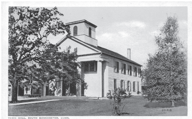
TOWN HALL, SOUTH MANCHESTER, CONN.

custom, but the desks, tables and bookcases in the engineer's office were all badly soaked. The town's voting machines were also stored in the building, but they were all moved out into the large lawn and later were removed to the basement of the Manchester Trust Company.