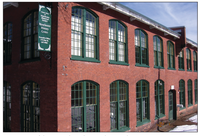
Some of the restored windows at the Manchester History Center.

Design & Printing: Grames Printing, Inc.