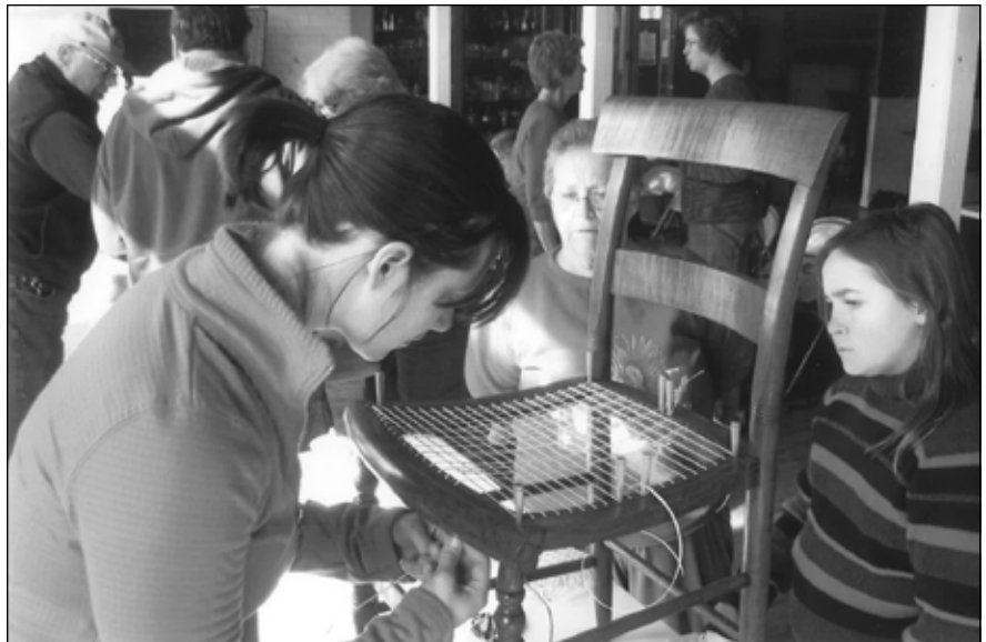
Participants recaning the seat of one of the Woodbridge chairs.