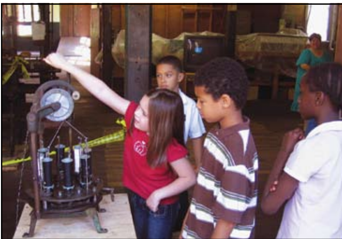
Third graders operating a braiding machine in the History Center Loom Room during the Annual May school tours.

The annual Third Grade Tours of the museums are being held through the month of May. This year 13 schools and about 600 students are scheduled to tour the Old Manchester Museum, Cheney Homestead, Keeney Schoolhouse, History Center Loom Room and the Fire Museum .