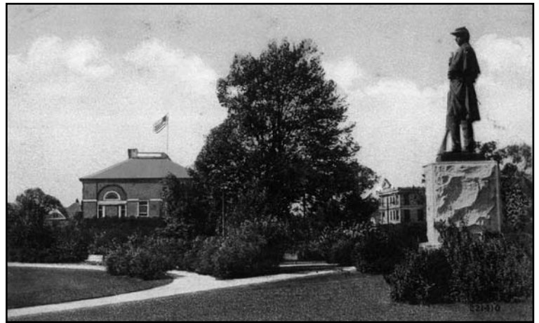
1910 postcard showing the elaborate landscaping of the northeast corner of the park

The recent focus on Mary Cheney Library's present function and future purpose has generated renewed appreciation for Center Memorial Park , the refreshing natural landscape that surrounds the Colonial Revival-style building. In recent weeks, increasing numbers have gathered at the Park at noontime most Fridays, Saturdays, and Sundays to walk along the curving pathways framed by period homes, verandas, and gardens. Establish a new tradition with a healthy open-air stroll with friends, or meet new ones at Manchester's unofficial town green. Soak-up sunny weather or renew your spirit on an overcast day amidst the gently-rolling landscape, and stately shade trees. While you are there, be a "tourist in your own town." Take a fresh look at local landmarks, public sculpture, and memorial monuments that grace the Park and are recognized by visitors as community treasures.