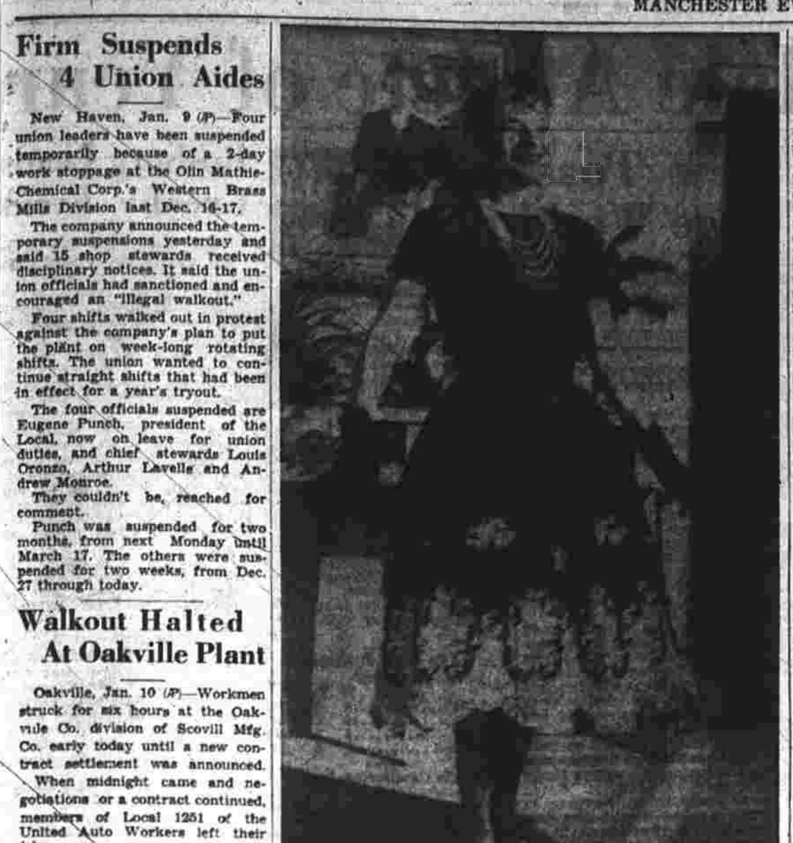
Drama at the Hemline Overlay of white lace applique adds dramatic touch to hemline of this creation by designer Jo Copeland. The black pompon taffets dinner dress is featured in her 1958 Spring collection. Cut low in back, it has a high front neckline and a full pleated skirt.