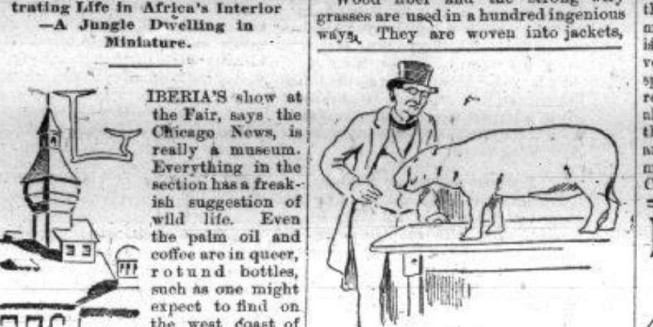
LIBERIA'S EXHIBIT. PRODUCTS OF AN AFRICAN REPUBLIC AT THE FAIR. An illustration of a person sitting at a table with various items of the Liberia exhibit...

LIBERIA'S EXHIBIT. PRODUCTS OF AN AFRICAN REPUBLIC AT THE FAIR.