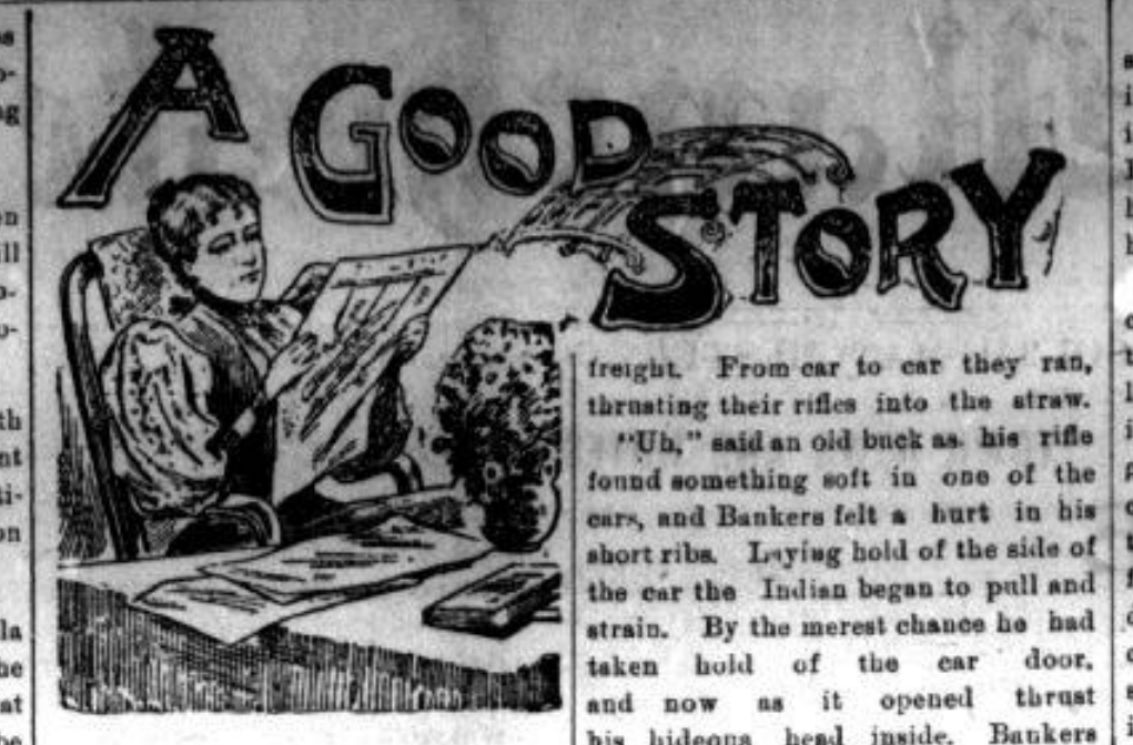
Woodrivers' Mad Night.