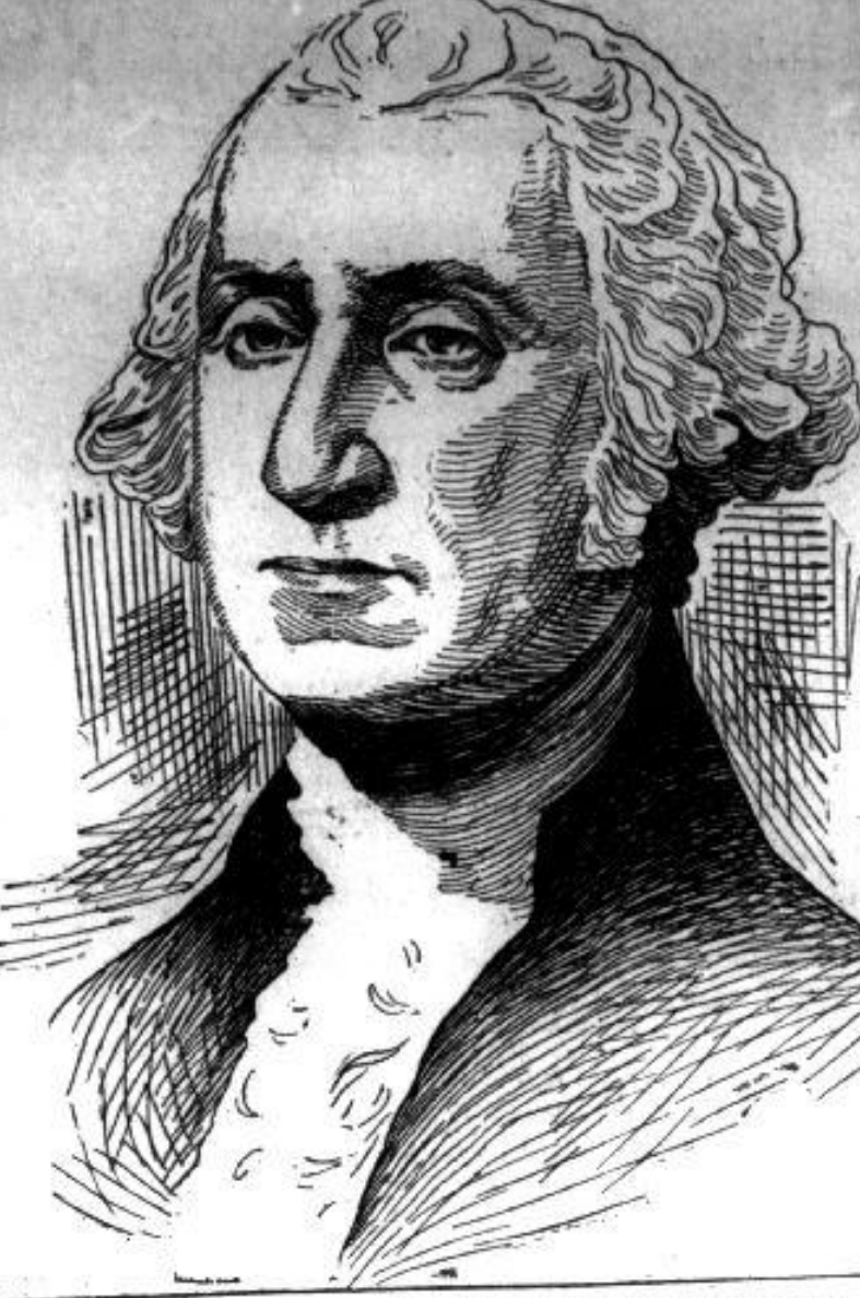
GEORGE WASHINGTON. BORN FEBRUARY 22, 1732. DIED DECEMBER 14, 1799.