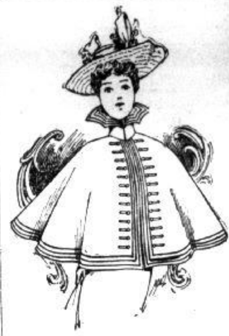
CAPE OF CADET BLUE CLOTH.