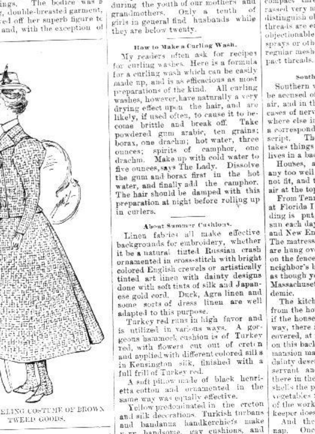
Illustration of a woman in a hat and dress, part of the 'Gothard's Latest Modes' advertisement.