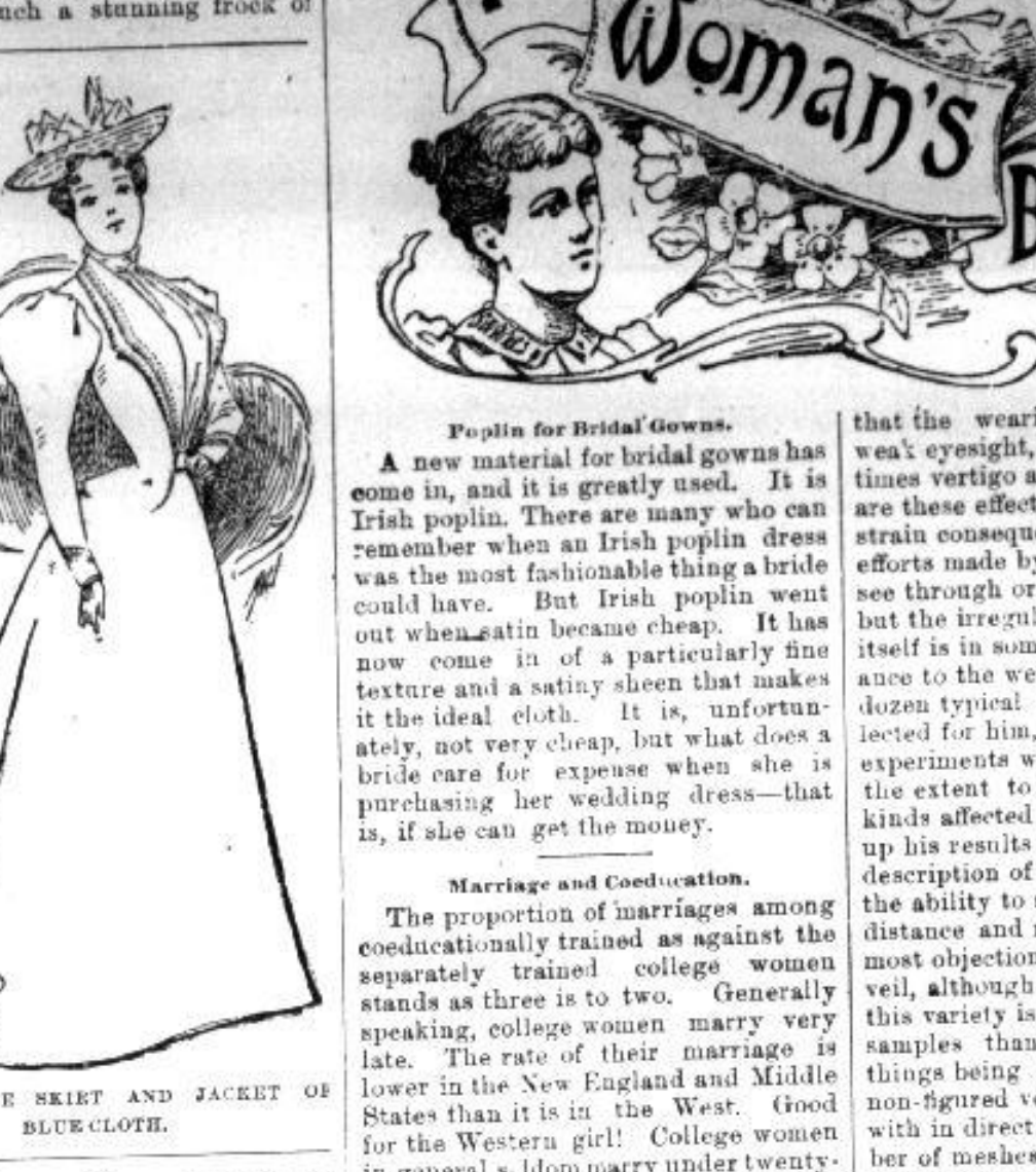
Illustration of a woman in a hat and dress, part of the 'Gothard's Latest Modes' advertisement.

THE SOUTH MANCHESTER NEWS, FRIDAY JUNE 18, 1897.