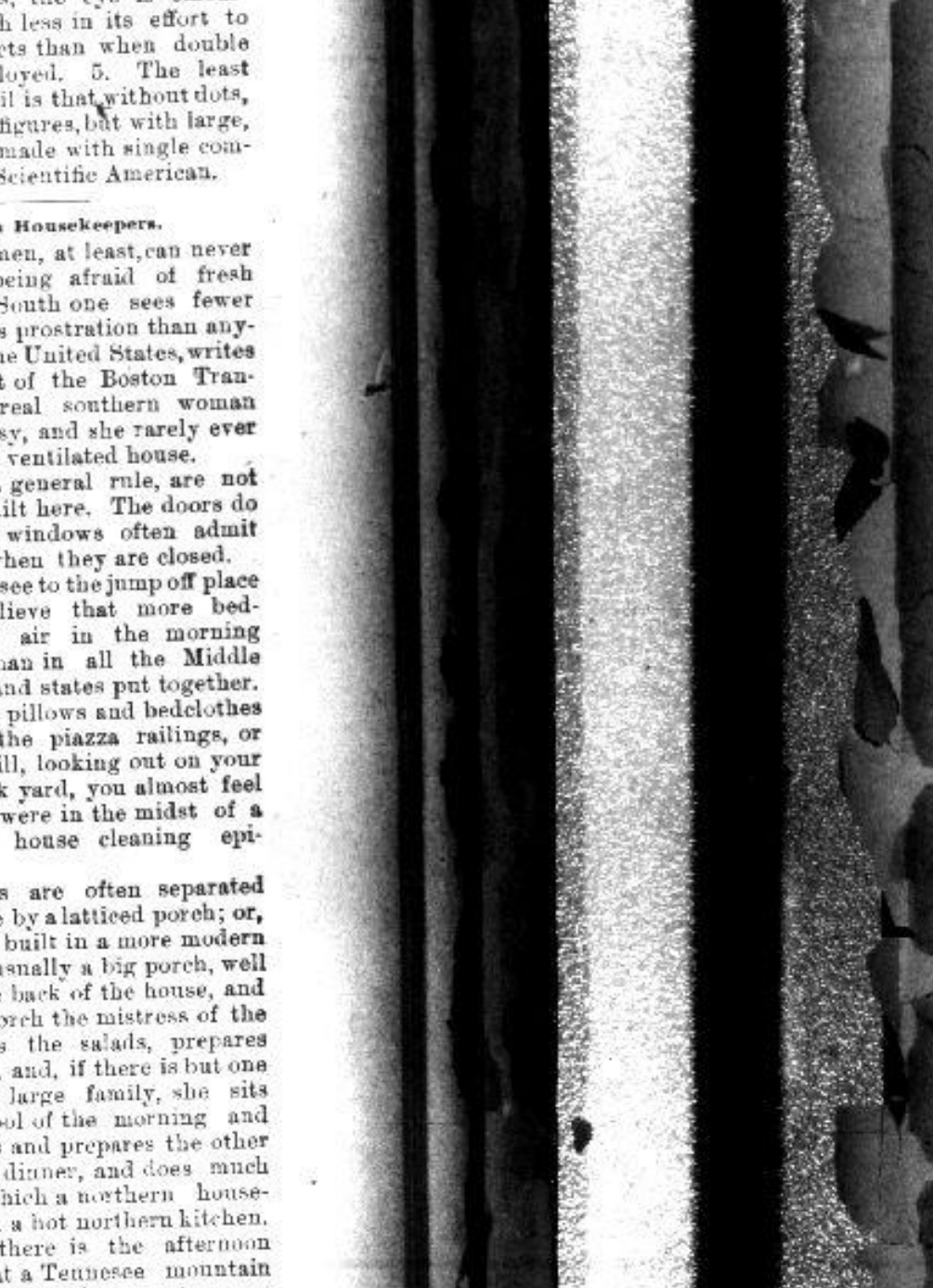
Illustration of a woman in a hat and dress, part of the 'Gothard's Latest Modes' advertisement.