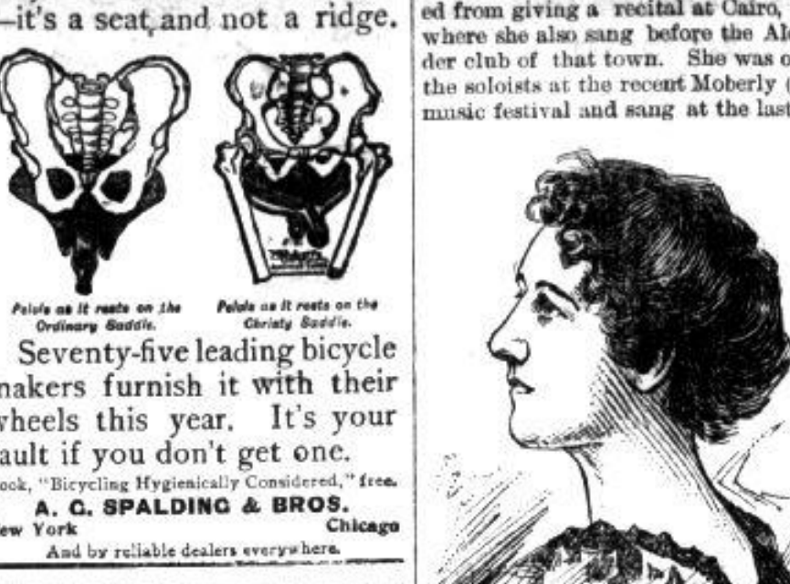
Seventy-five leading bicycle makers furnish it with their wheels this year. It's your fault if you don't get one.

Because he knows it was designed by a prominent physician to meet the requirements of bicycle riders and, unlike other saddles, it's anatomically correct—in other words—it's a seat, and not a ridge.