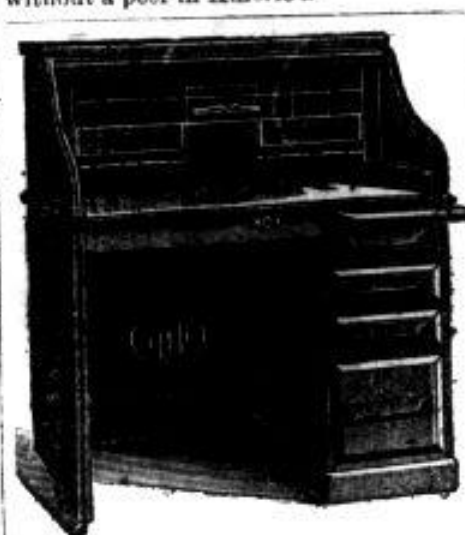
Facsimile of the desk given pupils at Morse's in place of the common "book desk" as used in ordinary business colleges.

All systems of teaching a trade in experience. Morse's Actual Business Practice as carried on at the Hartford Business College can well be put in the lead.