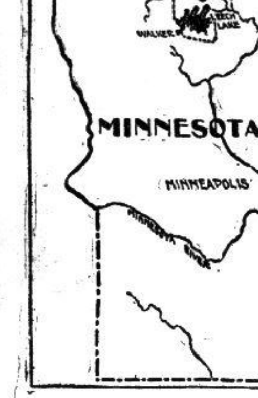
MAP OF THE INDIAN BATTLEFIELD.

Walker and the Indian agency is wild, leading a general uprising. Citizens do not feel safe, and are ready to retreat to their lives and homes. The latest reports are that the Chippewas and the Pillager Indians are reinforcing the Leech Lake tribe in large numbers. The prevailing opinion is that a general uprising is a certainty.