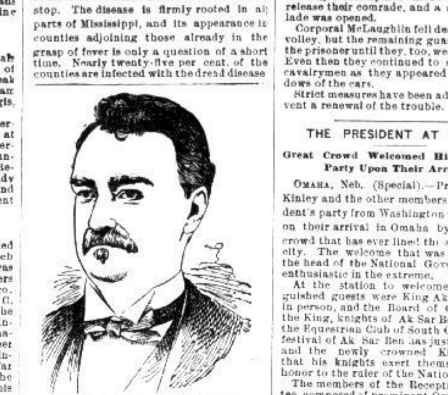
THE PRESIDENT AT OMAHA.

The stormy evening. A friend reads in the following, calling it 'Perpetual Motion.' The more you read it and think of it, the more there seems in it.