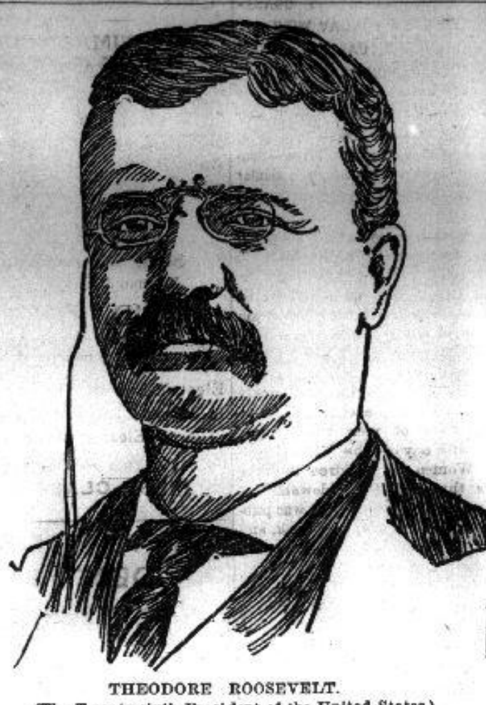
THEODORE ROOSEVELT. (The Twenty-sixth President of the United States.)