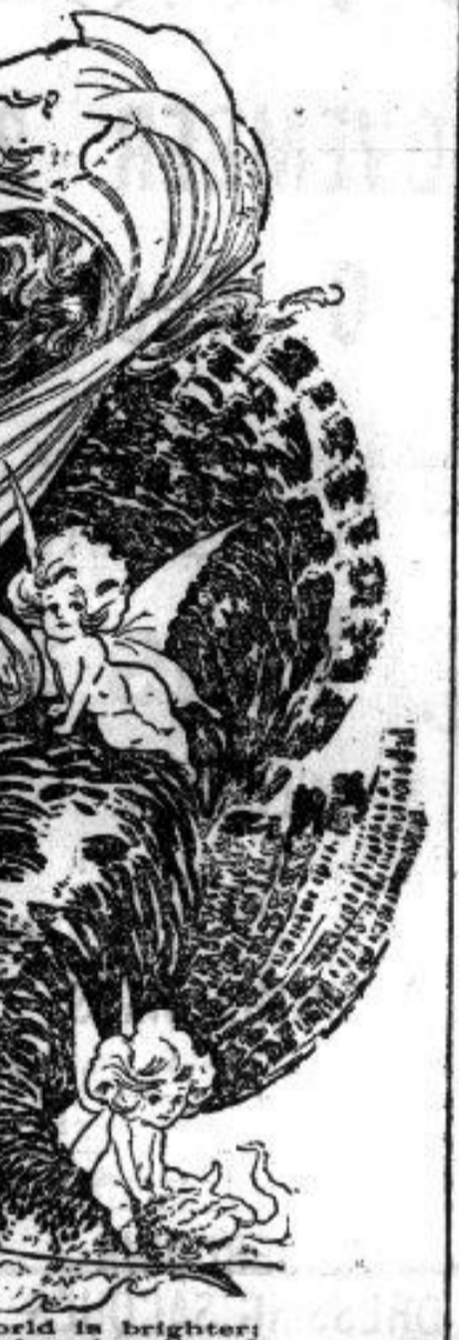
She comes, and the world is brighter... And the spirit of man is lighter...