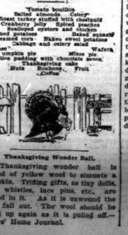
Thanksgiving Wonder Ball

either coast to obtain them... "Oh, I didn't mean that," the pale headed... "You don't suppose that I'm going to the expense of feeding a turkey from now until the twenty-sixth, do you?"