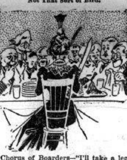
Not That Sort of Bird. Chorus of Boarders... First Thanksgiving... Second Thanksgiving...