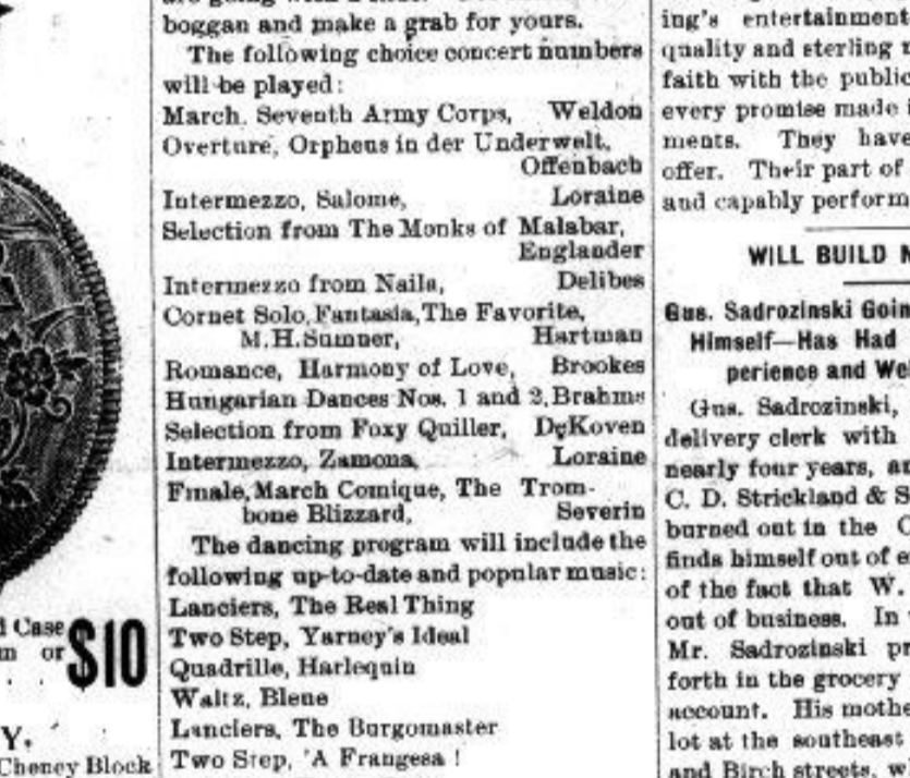
This twenty-year Gold-Billed Carriage with a Genuine Waltham or Elgin Movement for $10.00.

Specialist in the Diseases of the Eye, Ear, Nose and Throat, 1001 E. Church Street, Every Wednesday, 1:45 p. m. to 5 p. m.