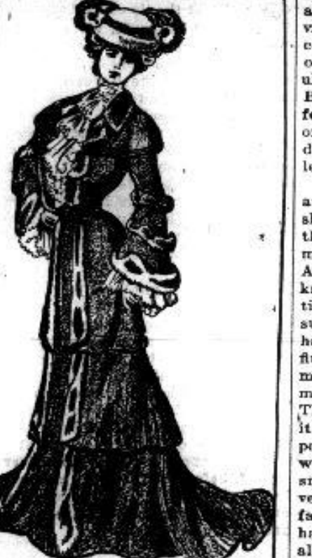
POPULAR WINTER MODEL.

Latest Fashions Display Many Original Features. Tailor Gowns are Undergoing a Change, Especially in the Way of Skirt-Revival at the Cloth Jacket. (Special Fashion Letter.) First seekers after winter fashions have to place themselves entirely at the mercy of the leading authorities on the subject. It is always a most difficult thing to get used to a strange mode, not until