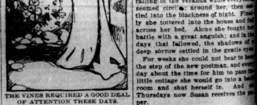
THE VINES REQUIRED A GOOD DEAL OF ATTENTION THESE DAYS.

French Statisticians Say 14,000,000 Men Have Been Killed During Last Century.