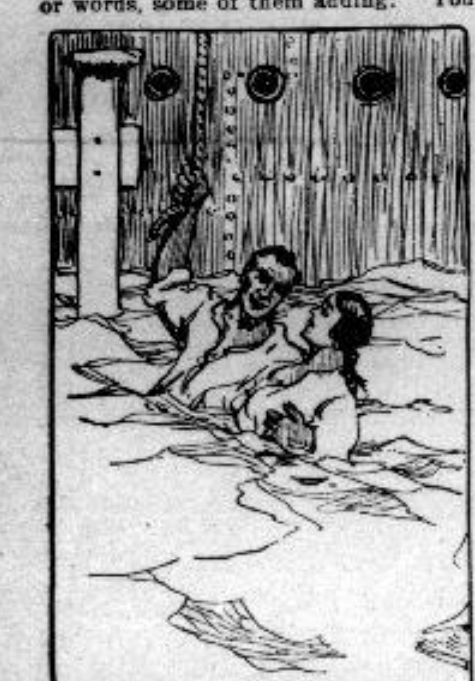
RAFO'S LEFT ARM ENCRICLED THE GIRL.