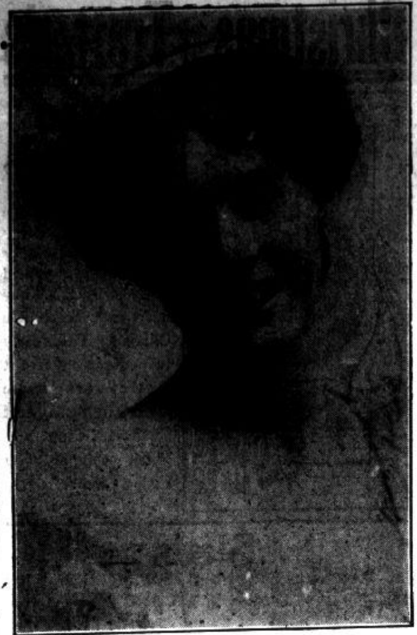
Mabel Taliaferro in "Polly of the Circus" at Parsons' Theater