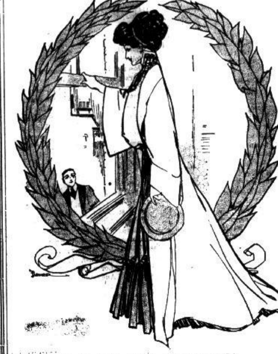
IF HE ONLY DARED SPEAK TO HER!

Why not have that Monument, Grave Mark or Set of Posts set up at once, when Nature helps to beautify the resting place of your departed relatives, and allow their friends to find such resting places when visiting the cemeteries?