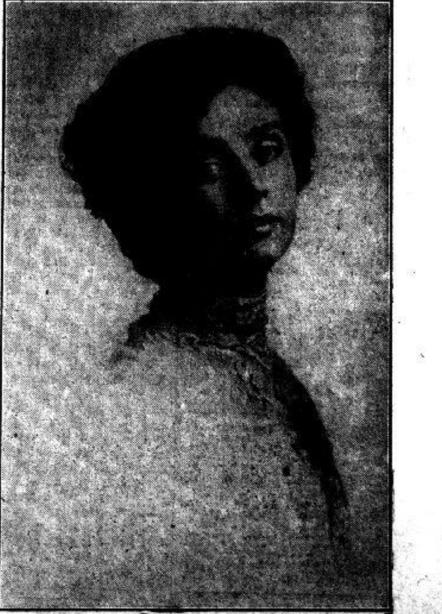
Fay Wallace in "Polly of the Circus" at Parsons' Theater.