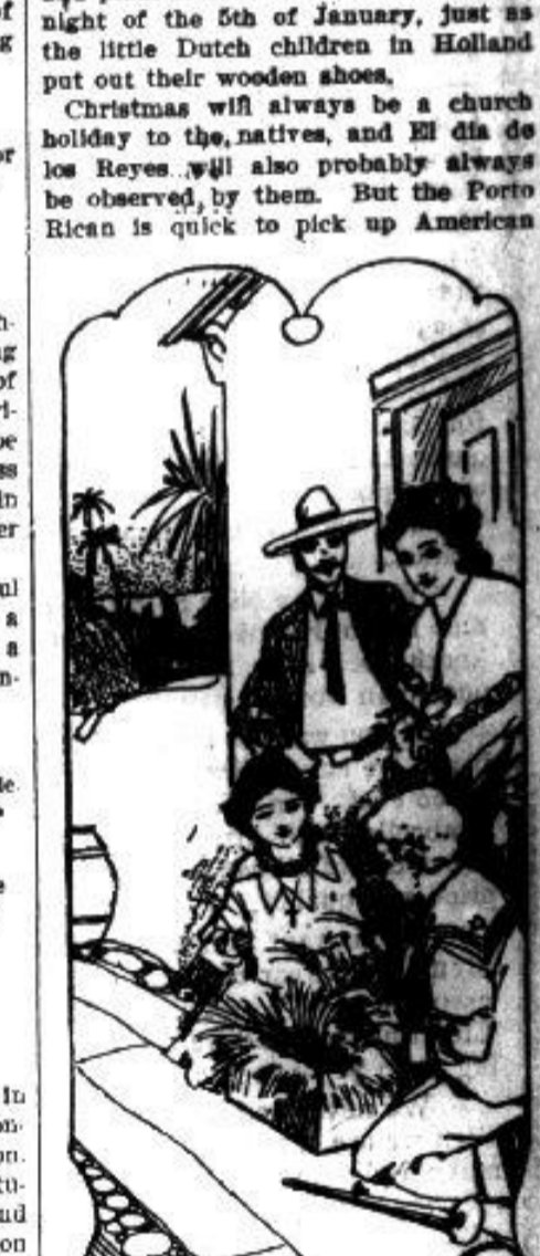
THE CHILDREN PREPARE A BOX TO BE SENT TO SANTA CLAUS.