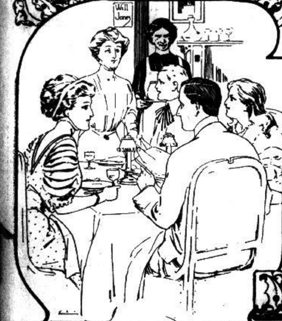
"WE'RE GOING TO A RESTAURANT FOR A REAL CHRISTMAS DINNER."