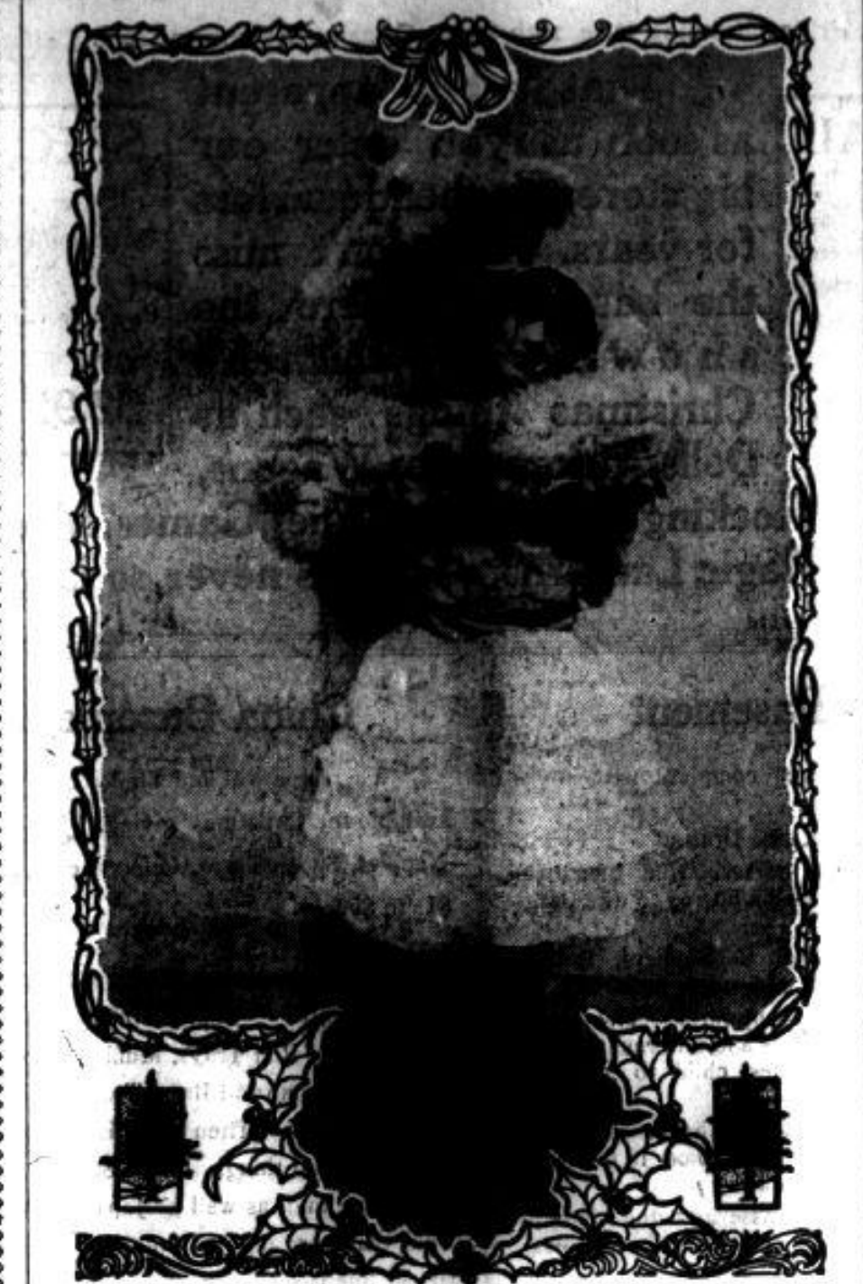
UNDER THE MISTLETOE.