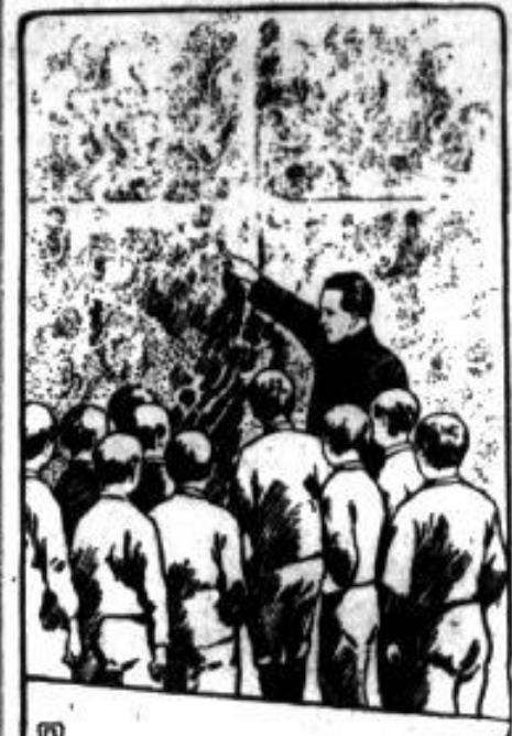
CLASS SHOWING OCEAN BOTTOM. Due to the state fishing schools. There are three of them, one each at the ports of Neuport, Ostend and Blankenbergh.

Most boys and many girls take naturally to fishing. Belgium, however, is the first country to teach fishing as a scientific industry.