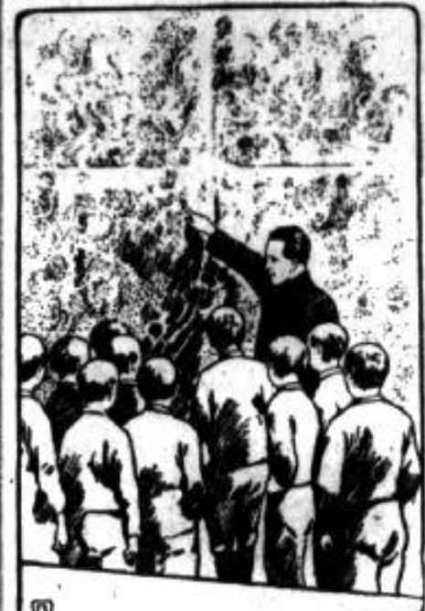
CLASS SHOWING OCEAN BOTTOM. Due to the state fishing schools. There are three of them, one each at the ports of Newport, Ostend and Blankenberge.

Most boys and many girls take naturally to fishing. Belgium, however, is the first country to teach fishing as a scientific industry.