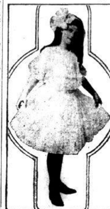
A GADGETS YOUNG BROTHER.