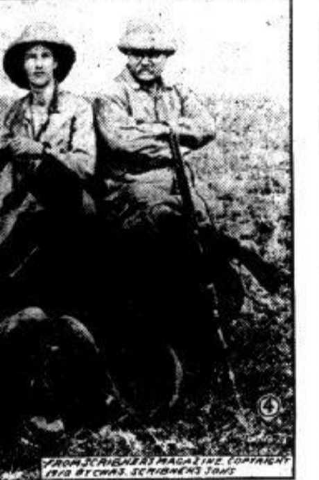
SWATSHOBS AT MR. ROOSEVELT'S TOUR

On the stage of the old world the monarchs of Europe since Napoleon Bonaparte made social calls at the head of the French army.