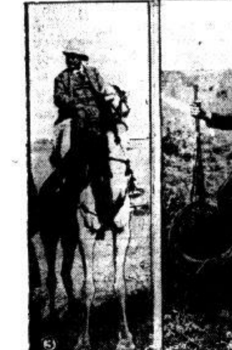
SWATSHOBS AT MR. ROOSEVELT'S TOUR

On the stage of the old world the monarchs of Europe since Napoleon Bonaparte made social calls at the head of the French army.