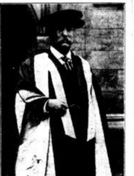
COLONEL ROOSEVELT AFTER RECEIVING HIS DEGREE FROM CAMBRIDGE.

ridden a camel in Egypt, listened to the riddle of the sphinx and been met by racing boat loads of American reporters on the waters of the Nile.