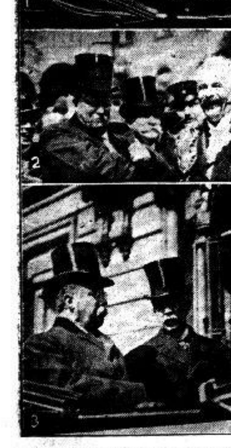
IN SWEDEN, GERMANY AND HOLLAND.

In Africa he became a child of the forest and the wild, kept going for