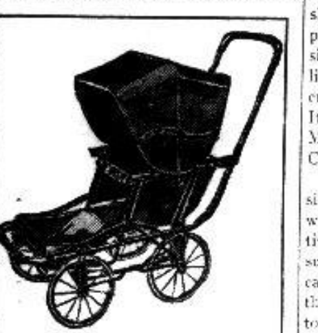
DOLL, BABY CARRIAGE.

What a Girl Likes. If she is a wee lassie who can just trundle a doll's carriage or is old enough to feel the real responsibility