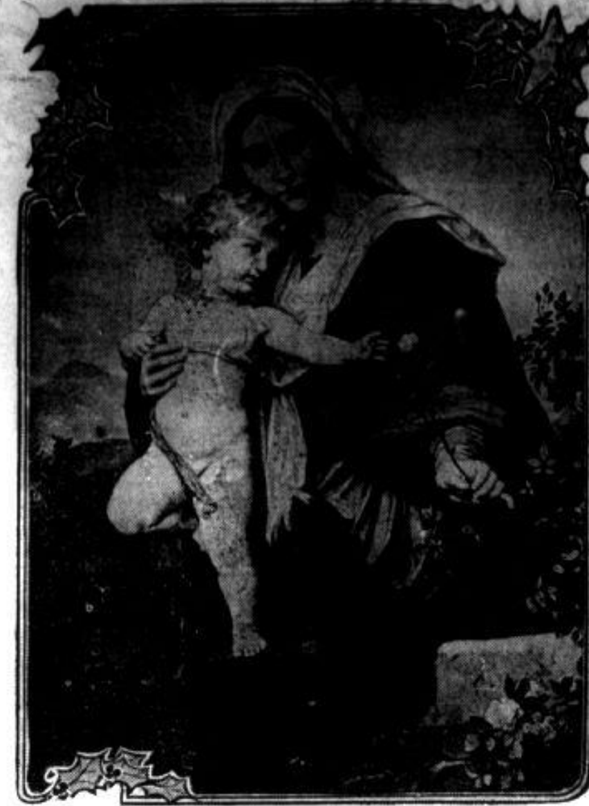
MARY AND THE INFANT JESUS.