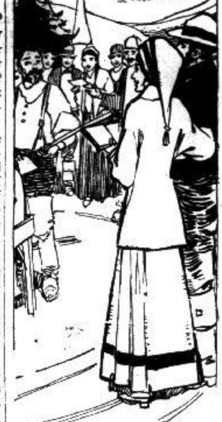
AD. BREIN A MARCH AROUND.