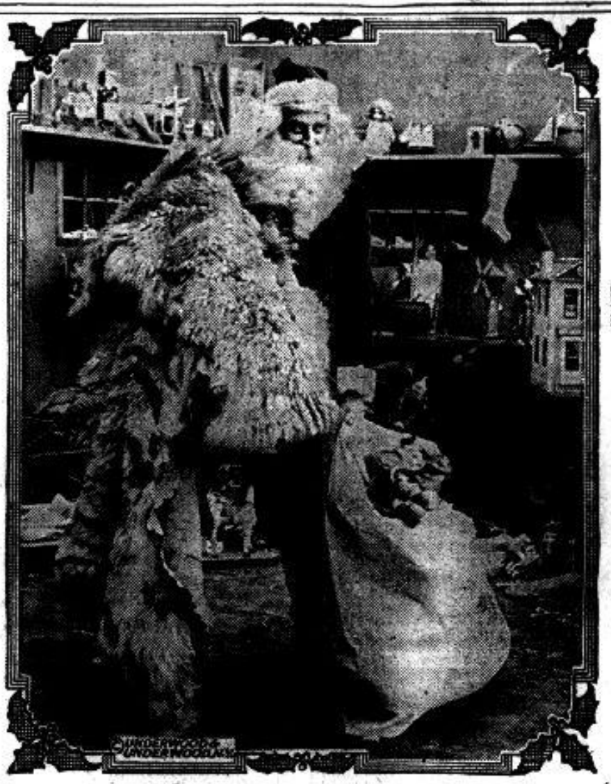
SANTA CLAUS READY TO START.