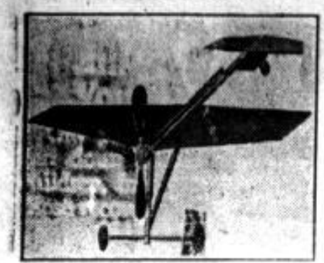
A TOY AIRPLANE. Captives airplanes which whiz around on a string are complete in every detail, and those made in cardboard are splendid toys that boys will be delighted to receive for Christmas presents.

The popularity of electric trains is reflected in the increased sales of electric trains and trams. The motor car and trolley figure prominently on the shelves. These are provided with motors, adjustable hoods, and each watch can be lowered, glass screens, lamps and even the trolley trolley itself. Monkeys and bears on trapezes, which squeal and grunt continually, are new and are bound to cause endless fun. There are those who have innumerable wonders into the motive power gives out.