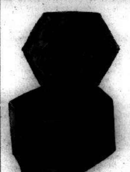
AN EASILY MADE BAG.

A LAST MINUTE GIFT. An Easily Made Bag of Dainty Cotton. Nothing could be easier to make than the bag illustrated, and for this season it is a splendid little gift.