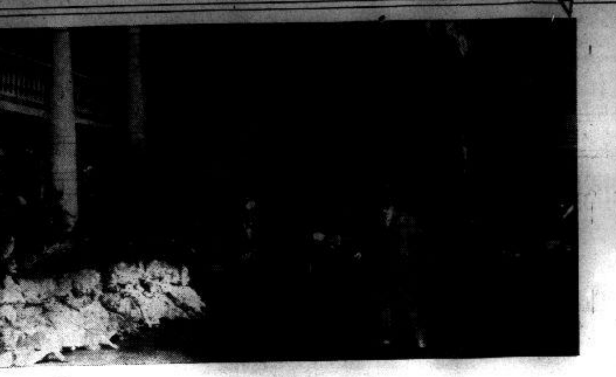
"Under Southern Skies" at Polis, Hartford, Next Week.