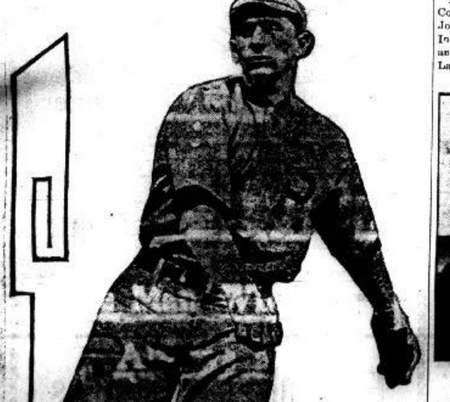
Sherrwood Magee, Hard-Hitting Outfielder.