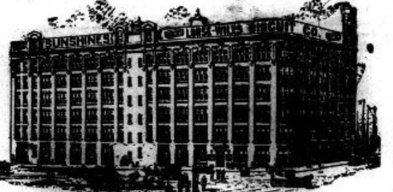
THE BAKERY WITH A THOUSAND WINDOWS WHERE "SUNSHINE BISCUITS" ARE MADE

The goods in this demonstration were shipped direct from the acknowledged to Be Most Sanitary and Up-to-Date Bakery in the World. Expert Chemists are employed in their Laboratory to inspect All New Materials Used in the Manufacture of Sunshine Biscuits and all their products are Guaranteed Under the Pure Food Laws. We cordially invite the South Manchester public to visit this Wonderful Demonstration and sale of the Most complete Quality Line of Biscuits in the world: Come, Taste, Know and Buy, if you Feel Disposed to. But Come, Know Oven Fresh Goods.