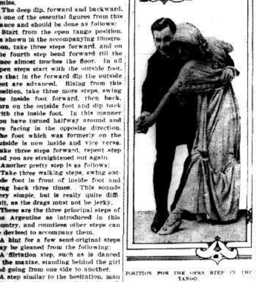
POSITION FOR THE OWN SEED IN THE TANGO.