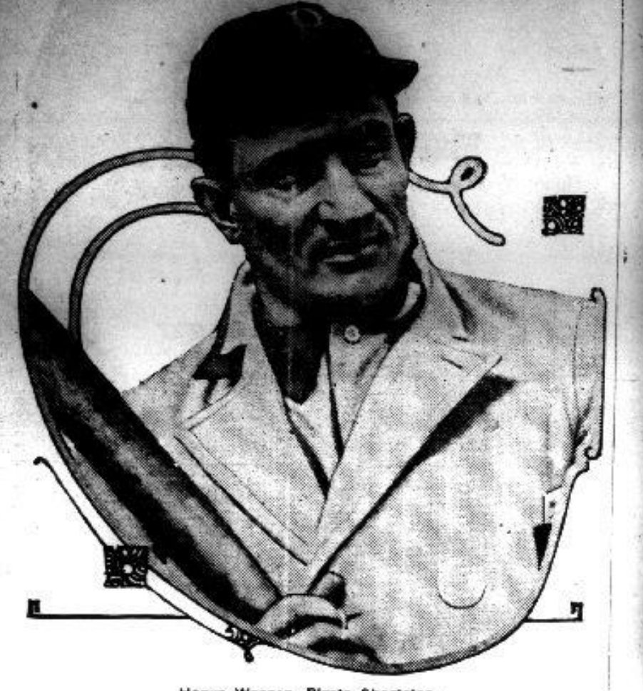
Honus Wagner, Pirate Shortstop.