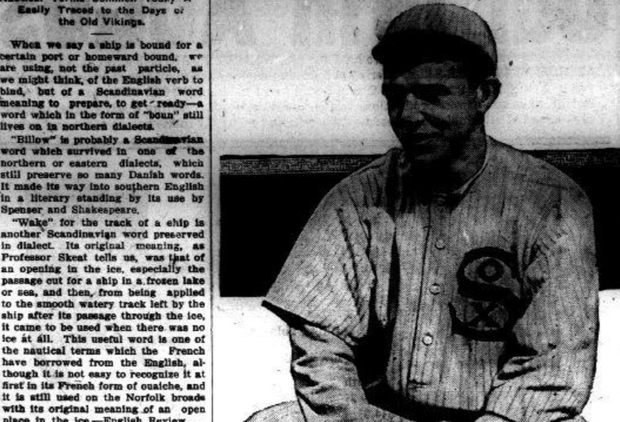
Ray Schalk, White Sox Catcher.

Chicago critics, in trying to discover a reason for the sudden fall of the White Sox from first place to the second division, blame the injury to Ray Schalk. This youngster is a wonderful catcher, and all the writers to the right and left behind the bat than any of the other catchers Callahan can boast of, it is claimed. But that is hardly the cause of the slump, for Callahan's pitchers have been doing good work, but the team has played poorly, and neither his nor fields up to a high standard.