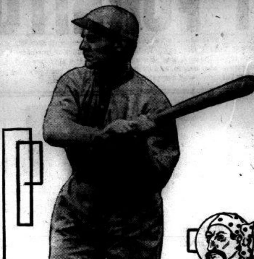
Max Carey, Pirate Outfielder.

When we say a ship is bound for a certain port or homeward, we are using, not the past participle, as we might think, of the English verb to bind, but of a Scandinavian word meaning to prepare, to get ready—a word which in the form of "bound" still lives on in northern dialects.