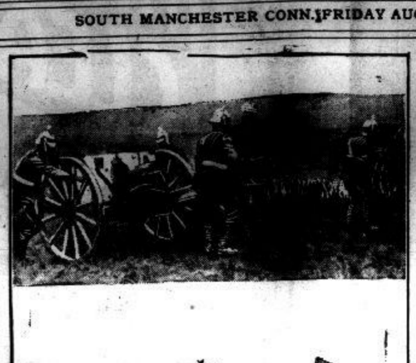
German and French Artillerymen

Artillery plays a big part in the great European war. Germany and France have devoted a great deal of attention to the development of their respective armies. Artillerymen of the German army are shown at the top and French artillerymen at the bottom.