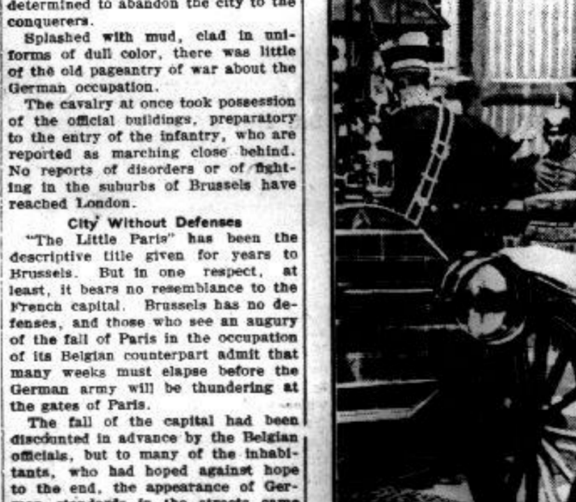
Kaiser After War Conference

Belgian Capital Occupied by the Kaiser's Cavalry Invaders Also Capture Louvain Evacuated Without Serious Attempt of Belgian Army to Make It-Allies Appear to Have Been Driven Back All Along the Line—Defeated Troops Reach Shelter of Strong Forts in Antwerp—Apprehension in Holland as Germans Get Close to Boundary—Doubt as to Ability of France to Hold Line Vital to Defense of Nation—Desperate Fighting and Many Casualties at Aerschot London, Aug. 21.—The flag of Germany flutters over Brussels. Into the capital of the Belgians clattered the German Uhlans, their entry unopposed. To save the city from bombardment and the destruction of priceless art treasures and venerable buildings that could never be replaced, the Belgians determined to abandon the city to the conquerors. Spahised with mud, clad in uniform of dull color, there was little of the old pageantry of war about the German occupation. All day Thursday the rumble of the German advance was reverberating through northern Belgium. Into the gap left insufficiently defended by infantry and artillery in tremendous strength have been pouring over the country already despoiled by the trail of the cavalry. The Mense, that has been reddened with blood for the first time since the days of the passage of scores of thousands of men. Belgians in the north retreated without fighting until they reached the shelter of the strong forts at Antwerp. The German cavalry has been