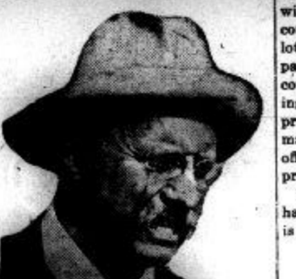
Colonel Theodore Roosevelt