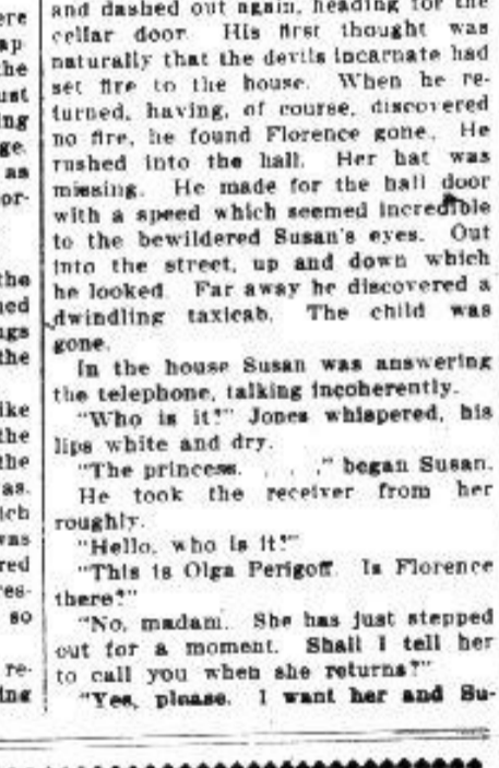
He Tried the Doors They Were Locked.