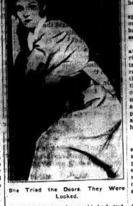
She Tried the Doors They Were Locked.