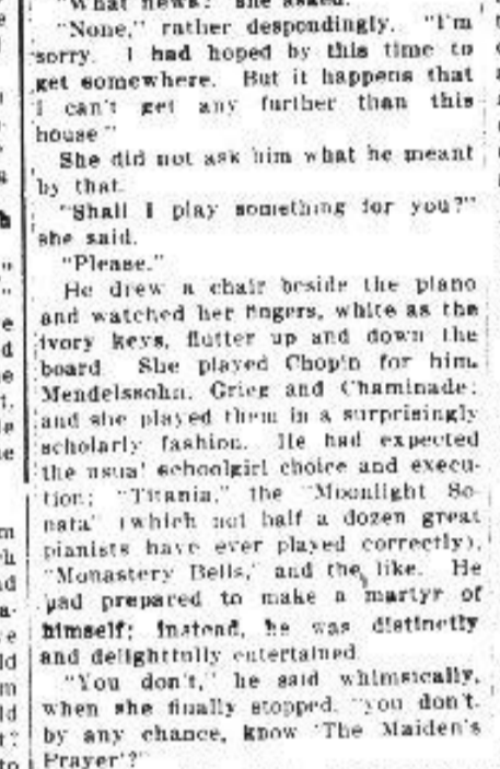
He Tried the Doors They Were Locked.