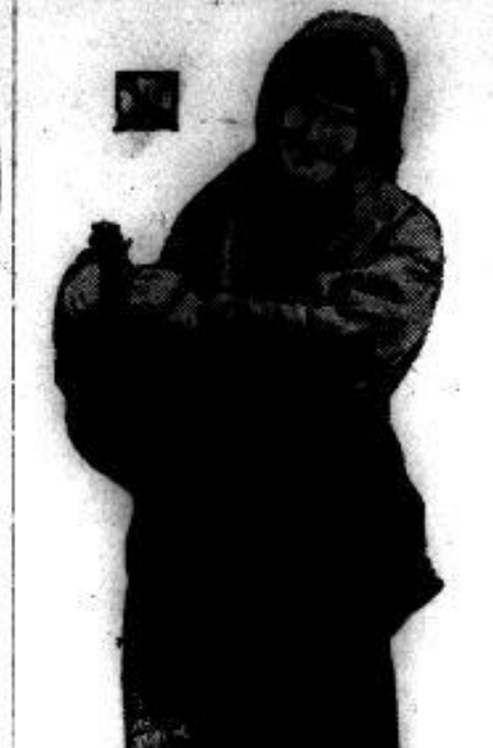
The Quick Smile of the Celtic Race

Here he loosed from his hold A brown tumbler of wine, Till the wind on the sea Bore the strange melody Of an island that sings.