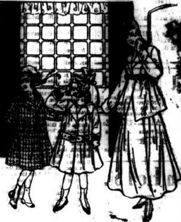
STYLISH $8.98 SPRING COATS FOR WOMEN AND MISSES. An unusual collection of stylish coats for spring and summer wear in black and white shepherd and large checks, covets and serges. Straight and belted coats are included in these pretty coats. Specially priced at $6.50.

Women's Handsome $20 Tailored Suits of Satin Gaberdine. A new and very attractive hand tailored model in satin gaberdine lined with peau de cygne. The belted coat has a removable fancy silk collar and self belt.