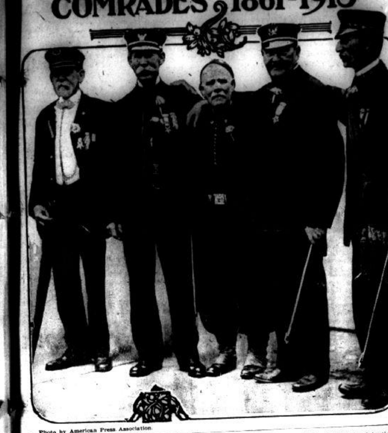
The Hero of Bellbridge A Memorial Day Story

When Captain Hiram Jobey, commander of Bridgeport post, G. A. R., awakened on the morning of May 21 his entire belief was centered on the conflict and sense of guilt.