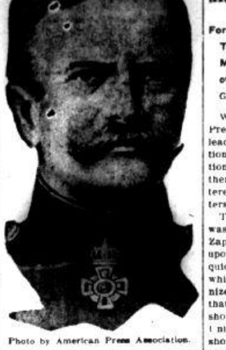
Von Bernstorff To Show True Feeling of America to Germany.