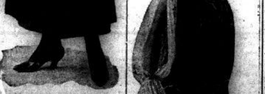
HANDSOME FOX SET. Cross for one consisting of muff and...