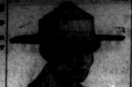
WHITE FELT SAILOR. The chic hat for early autumn wear...