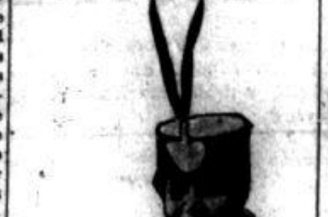
SMART EVENING WRAP. Smart evening wrap of sage green...