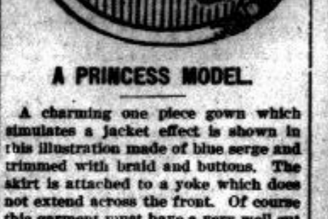
A PRINCESS MODEL. A charming one piece gown which...