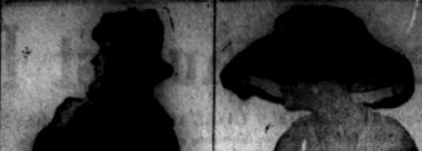
EARLY AUTUMN HAT. One of the autumn hats with wide...