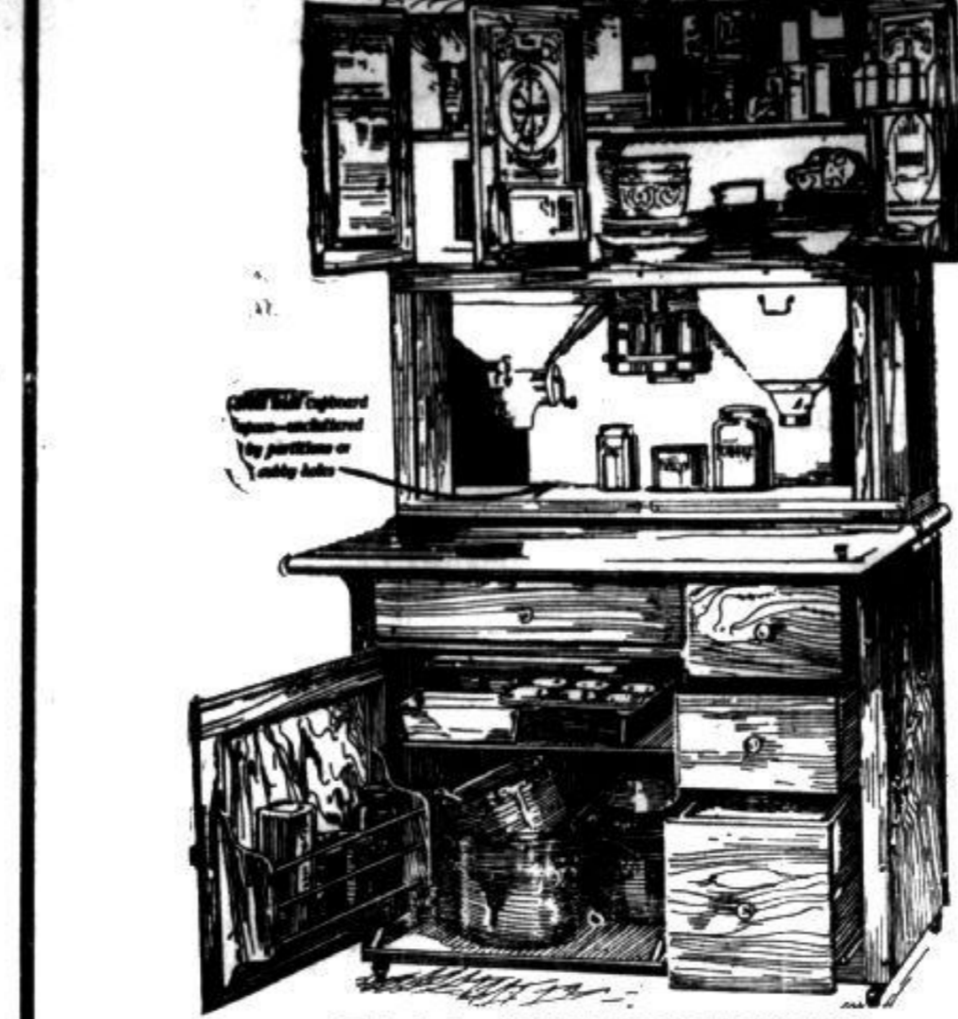
This is the "ROLL DOOR HOOSIER" With the only sanitary, removable roll doors.

Manchester's Finest Building Lot Development. Situated in the heart of the town with Trolley, Water, Electric Lights, Gas, etc., available. Its location on Main Street between the North and South Ends of the Town makes a rapid growth in value a certainty.