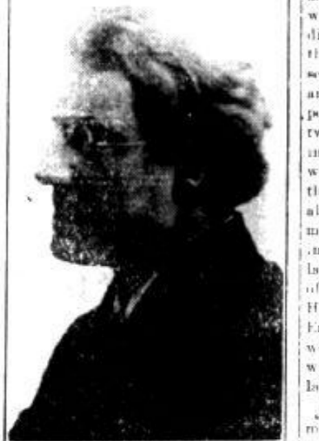
RABBI STEPHEN S. WISE