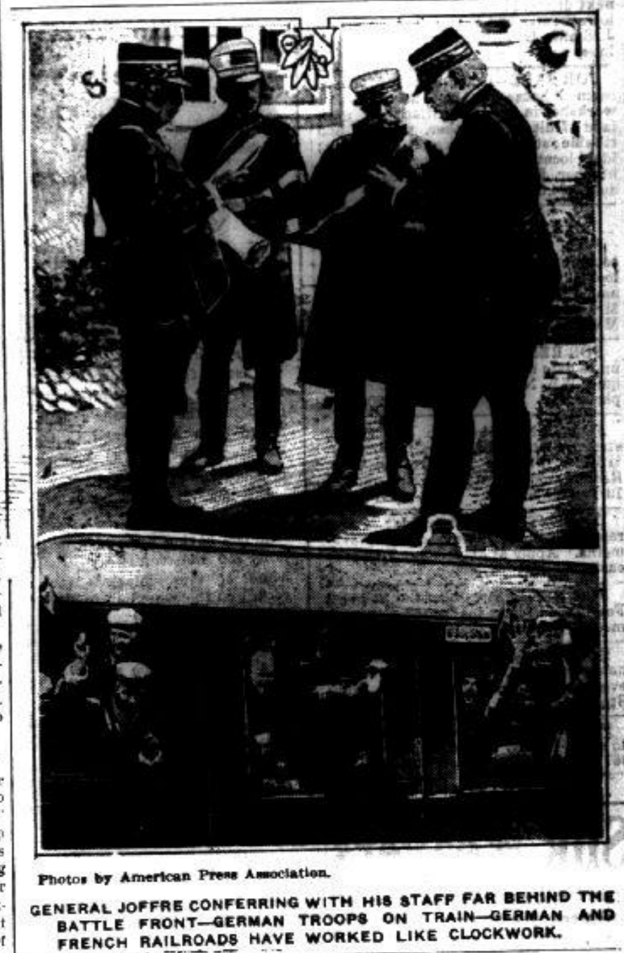
GENERAL JOFFE CONFERRING WITH HIS STAFF FAR BEHIND THE BATTLE FRONT—GERMAN TROOPS ON TRAIN—GERMAN AND FRENCH RAILROADS HAVE WORKED LIKE CLOCKWORK.

When the long watches begin: "What is the good of this staff anyway, if it will not let me have what I want? Why let it down? Will make it better to have it."