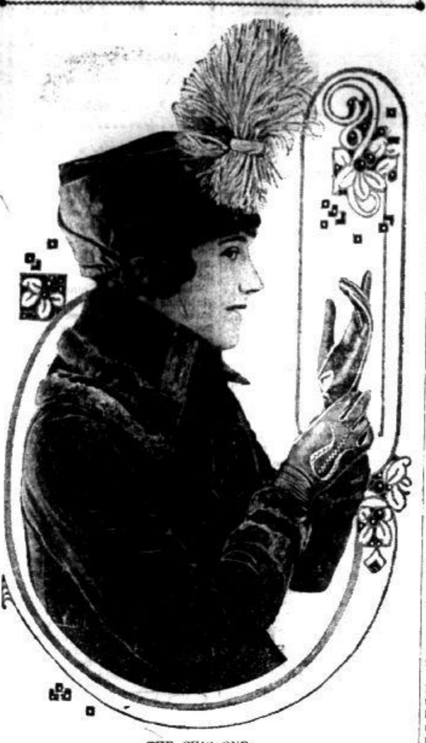
THE CHIC ONE

THIS is a study in black and white. With a black velvet suit, fur trimmed, is worn this draped turban; also black velvet mounted with a white ostrich plume.