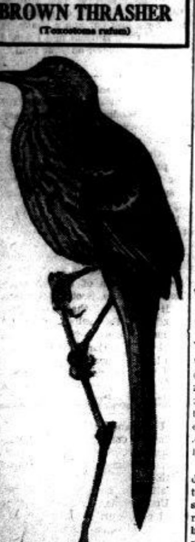
Length, about eleven inches. Brown above, heavily streaked with black below.

Length, about eleven inches. Brown above, heavily streaked with black below. Range: Breeds from the Gulf states to southern Canada and west to Colorado, Wyoming and Montana; winters in the southern half of the eastern United States.