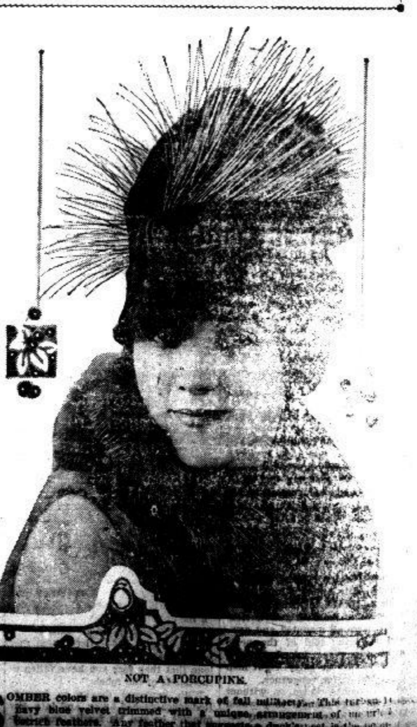
NOT A PORCUPINE.

Convenient Duster. Buy a little ten cent dish mop. Stirrate it with furniture oil and use it when dusting window sills, mop boards, chairs, etc.