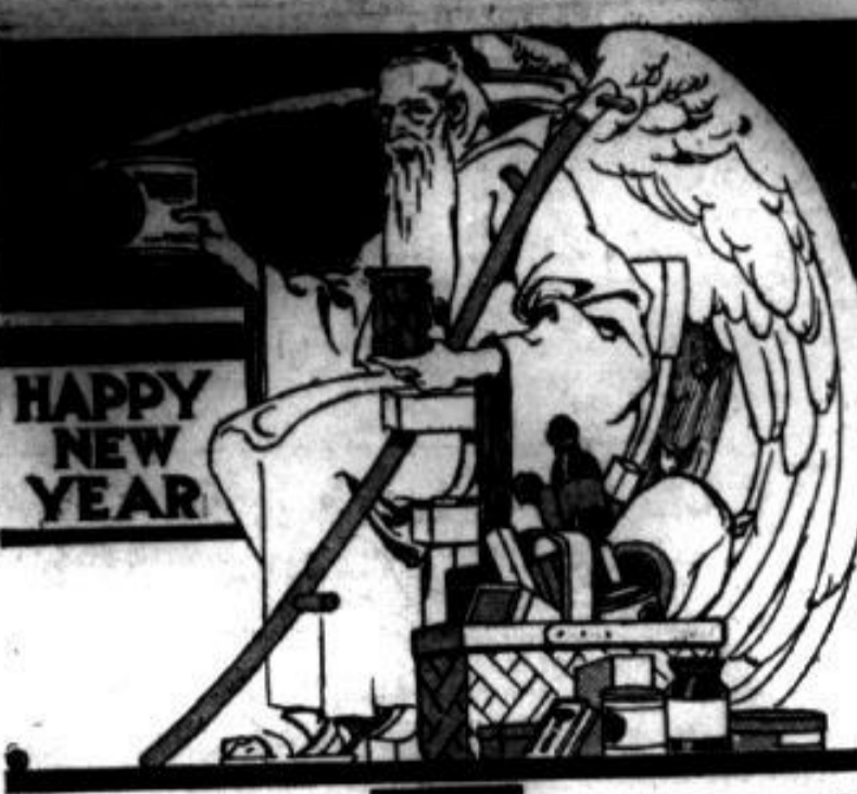
Call and be convinced

BEGIN THE NEW YEAR RIGHT BY TRADING FOR CASH. IF YOU DEAL WITH US ONCE YOU'LL COME AGAIN.