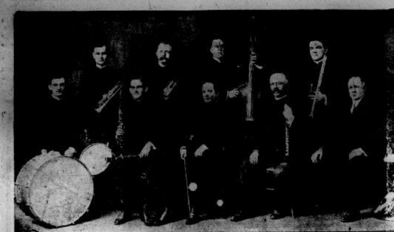
McENNELLY ORCHESTRA COMING TUESDAY