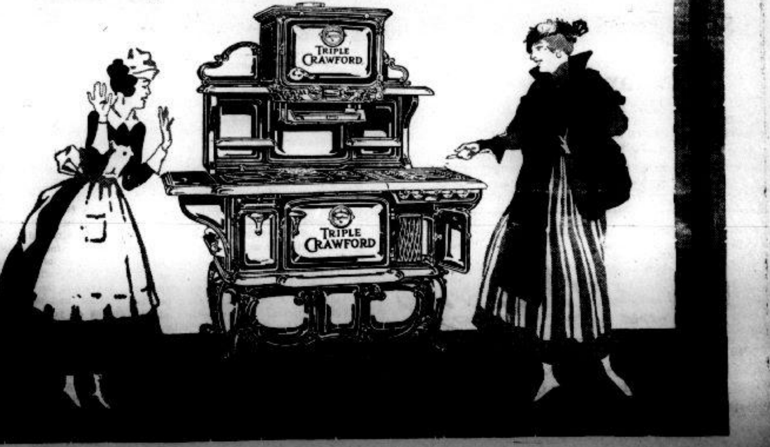
(To Be Continued.)