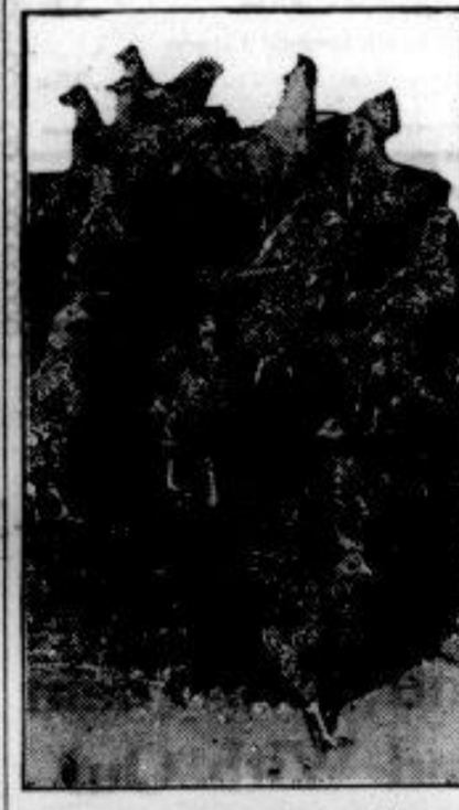
Well-Selected Flock of Young Hens of Uniform Size.

Nest Should Be in Some Quiet Place Where She Won't Be Disturbed—Handle Carefully. (Prepared by the United States Department of Agriculture) The first sign of a hen being broody (wanting to set) is that she stays longer on the nest when laying, and on being approached will quite likely remain and make a clucking noise, ruffle her feathers and peck at the intruder. When it is noted that a hen sets on a nest from two to three nights in succession and that the feathers are disappearing from her breast which should feel hot to the hand, she is ready to be transferred for setting to a nest which has pre-