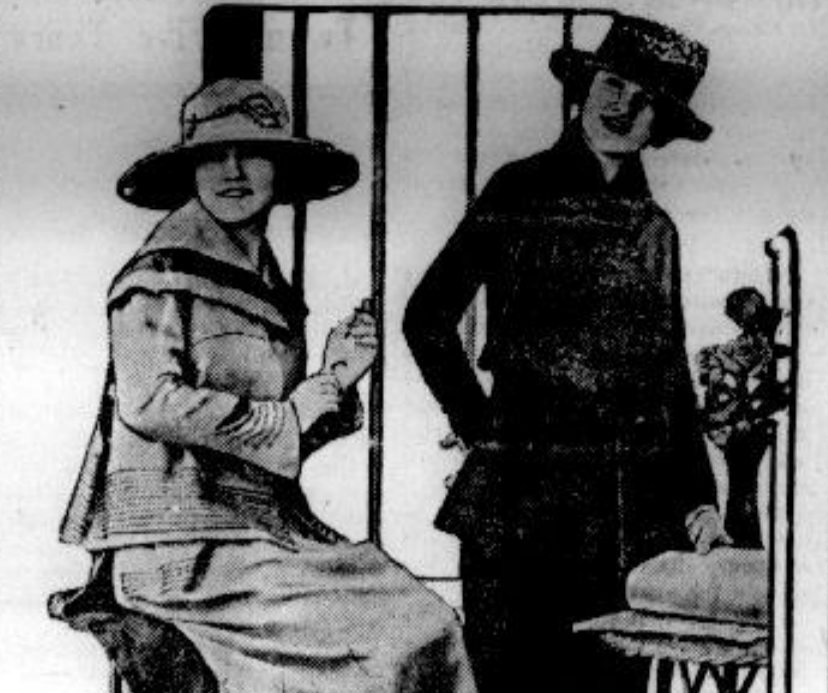
Paris (By Mail)—The most serious worries of the new Czechoslovak Republic are the food situation and bolshevism.