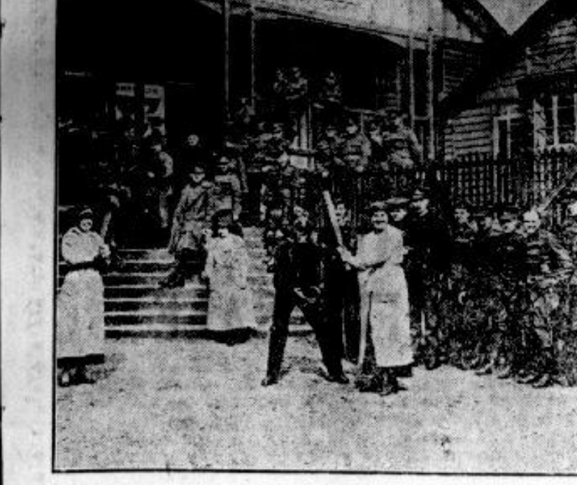
Outside of Eagle Hut, the Y. M. C. A. home for American soldiers in London. The ladies are canteen workers at the center.