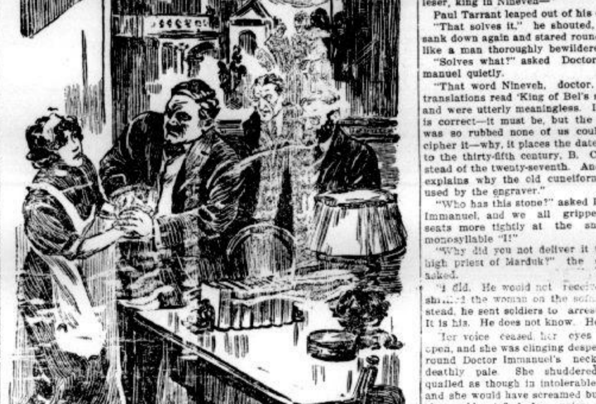
"OPEN YOUR HANDS!" YELLED TARRANT, "WHAT HAVE YOU GOT, THERE? OPEN THEM, I SAY!"