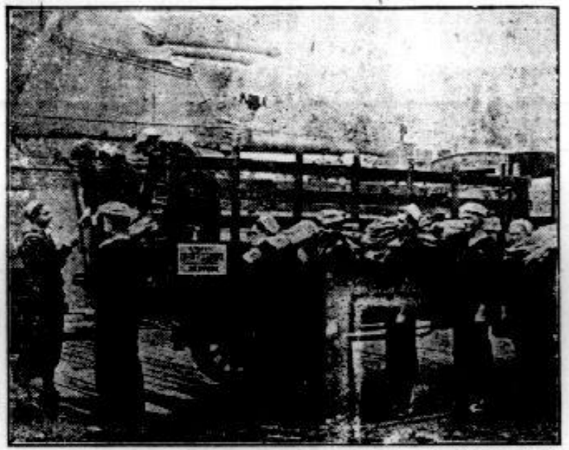
Salvo from the U. S. S. New Jersey Exchanging Junk for Thrift Stamps.

Why keep household accounts? Do you know what your careless, useless expenditures amount to each year? What could be omitted and still provide a comfortable happy life for you, when and what you receive, and when, where and for what you spend.