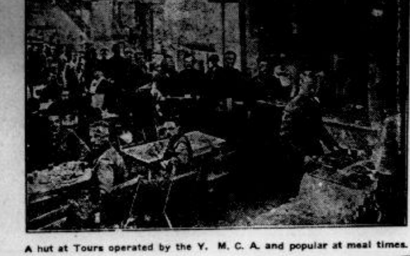
A hut at Tours operated by the Y. M. C. A. and popular at meal times.

Western, R. L. 3 each; Montpellier, Vt. Bennington, Vt. Lawrence, Mass. Attleboro, Mass. Chelsea, Mass. Milford, Mass. Salem, Mass. Wakefield, Mass. Westfield, Mass. Bristol, Conn. Manchester, Conn. Norwich, Conn. Stamford, Conn. 2 each.