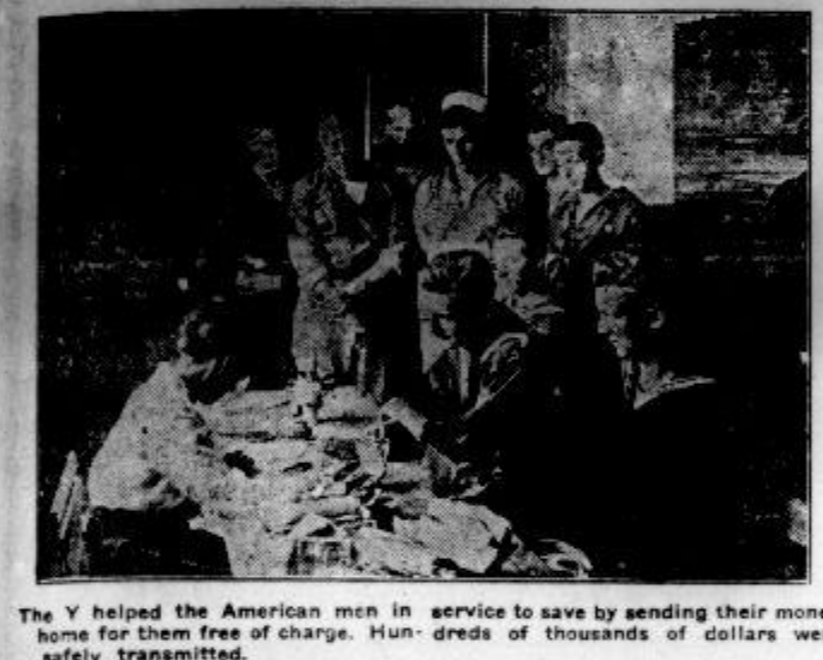
The Y helped the American men in home for them free of charge. Hundreds of thousands of dollars were safely transmitted.