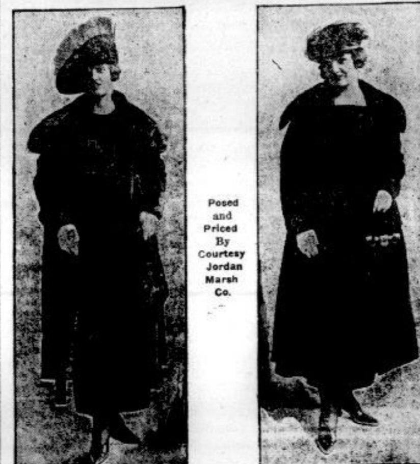
Poed and Picked

Expert Buyers Say Women Can Purchase Modish Merchandise at Medium Cost Despite High Prices.